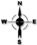
Sketch Floor Plan

Land Size _____ No. of Rooms _____ Construction - Roof _____ Walls _____ Water Pressure _____ No. of Bathrooms _____